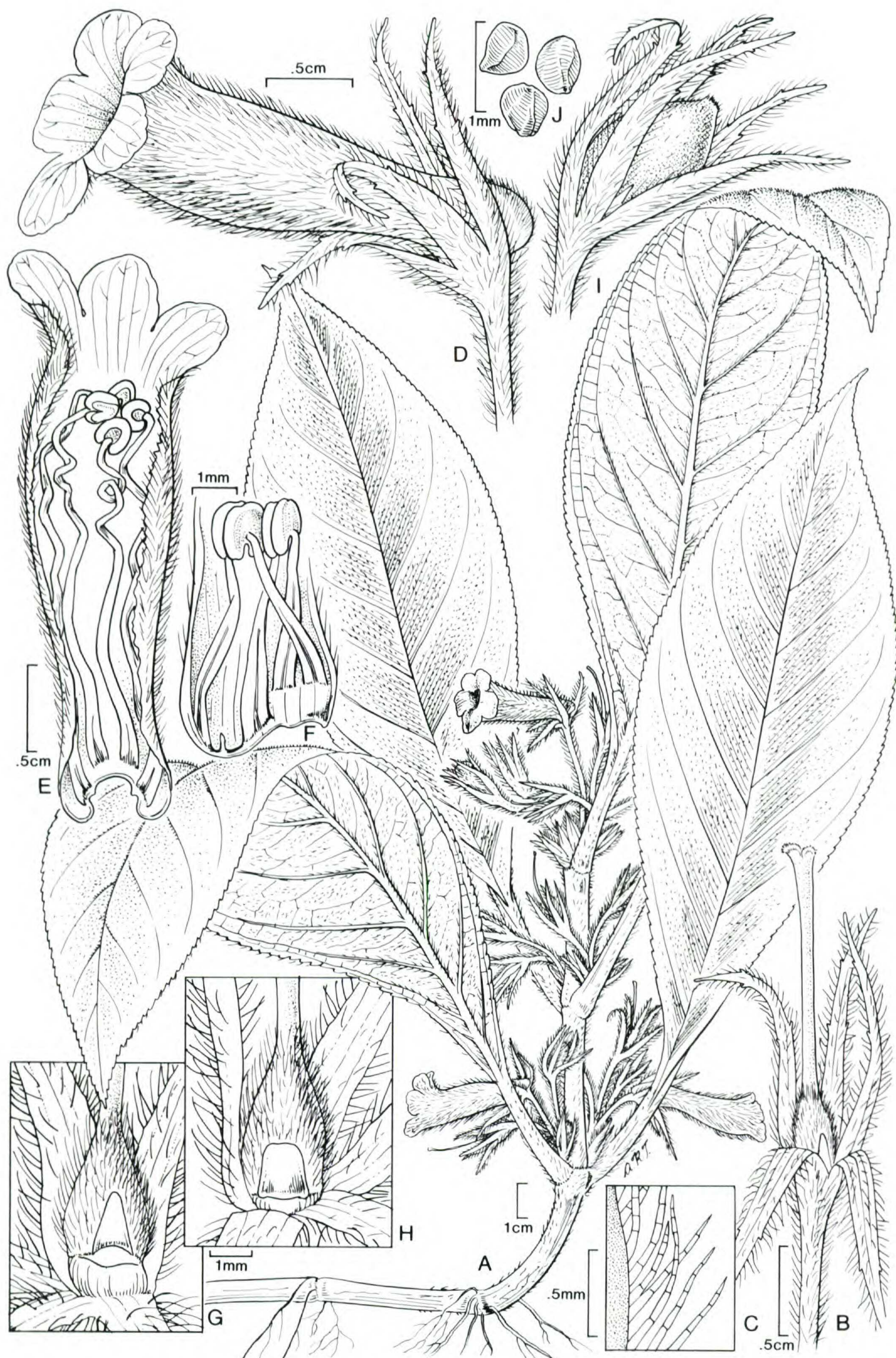
Figure 5. Nautilocalyx fasciculatus . — A. Habit. — B. Flower with corolla removed. — C. Sepal margin. — D. Flower. — E. Corolla opened, with stamens after anthesis. — F. Corolla base with young stamens. — G. Ventral nectariferous gland. — H. Dorsal nectariferous gland. — I. Capsule with persistent calyx. — J. Seeds. (All from Maguire, Cowan & Wurdack 29982.)